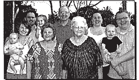
With our family living on three continents, this is a rare photo.